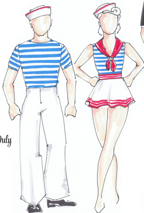
Fourth of July