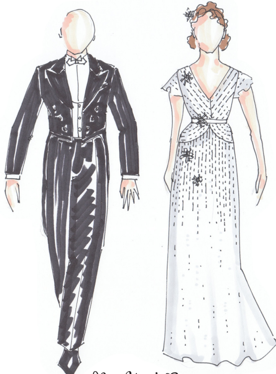
New Year's Eve