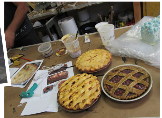
Goodspeed's Prop Shop creates delicious-looking pies!