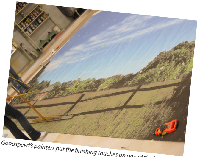
Goodspeed's painters put the finishing touches on one of the backdrops.