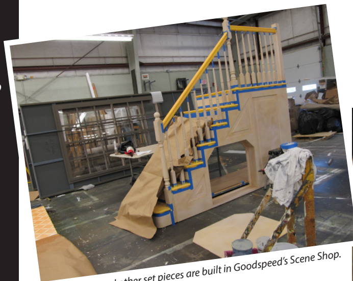
The staircase and other set pieces are built in Goodspeed's Scene Shop.